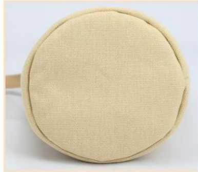
Round reinforcement at the bottom