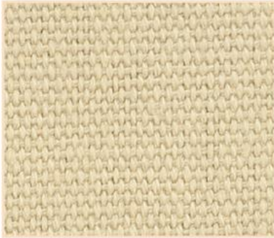
High quality fabric