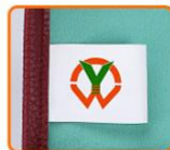
WASHING CARE LABEL