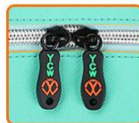
RUBBER ZIPPER PULLER