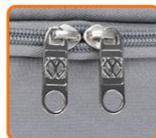
METAL DEBOSSED ZIPPER PULLER