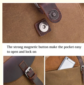
The strong magnetic button make the pocket easy to open and lock on