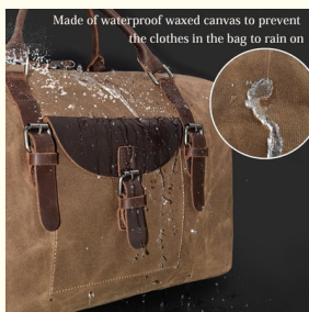
Made of waterproof waxed canvas to prevent the clothes in the bag to rain on