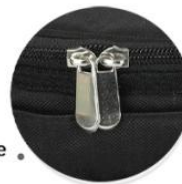
Smooth double zipper