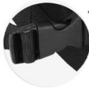
• Plastic buckle