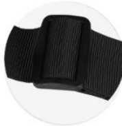
• Adjustable shoulder straps